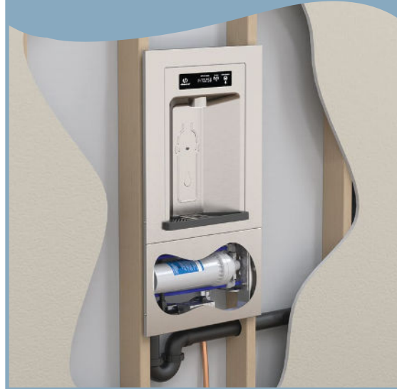
Fits Between 16" Studs