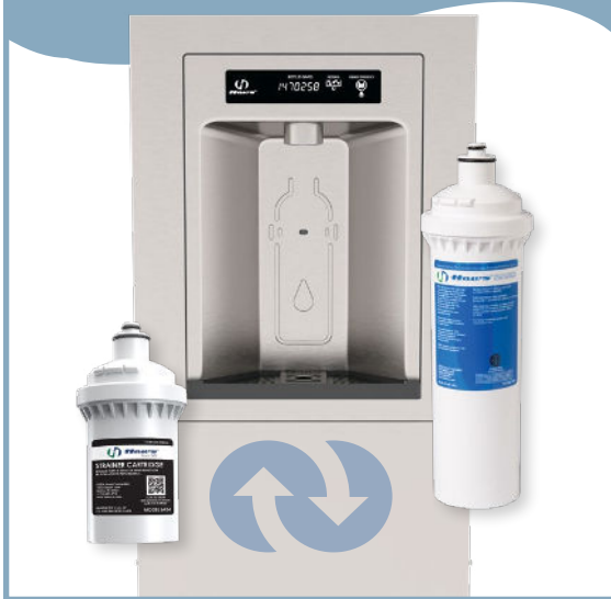
Field Configurable Filtration