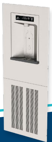
2000HSA.8 CHILLED RECESSED BOTTLE FILLING STATION

Back access only configurations available upon request.