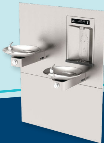
1011HSA RECESSED BOTTLE FILLING STATION WITH HI-LO FOUNTAINS