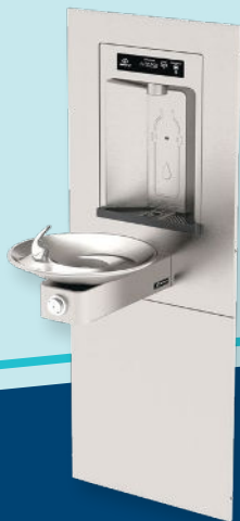
1001HSA RECESSED BOTTLE FILLING STATION WITH SINGLE FOUNTAIN