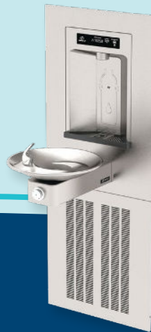
1001HSA.8 CHILLED RECESSED BOTTLE FILLING STATION WITH SINGLE FOUNTAIN