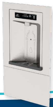
2000HS RECESSED BOTTLE FILLING STATION