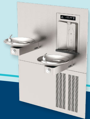
1011HSA.8 CHILLED RECESSED BOTTLE FILLING STATION WITH HI-LO FOUNTAINS