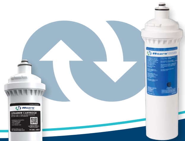
6434 5-YEAR STRAINER CARTRIDGE