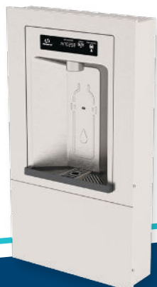
2000HSSM SURFACE MOUNT BOTTLE FILLING STATION